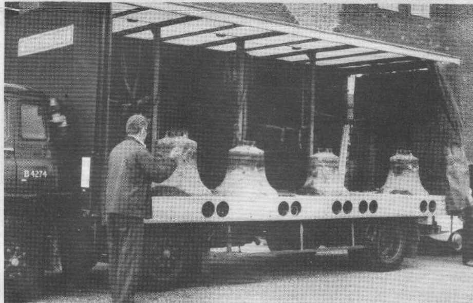
Delivering the old bells to the Whitechapel Bell Foundry, London.