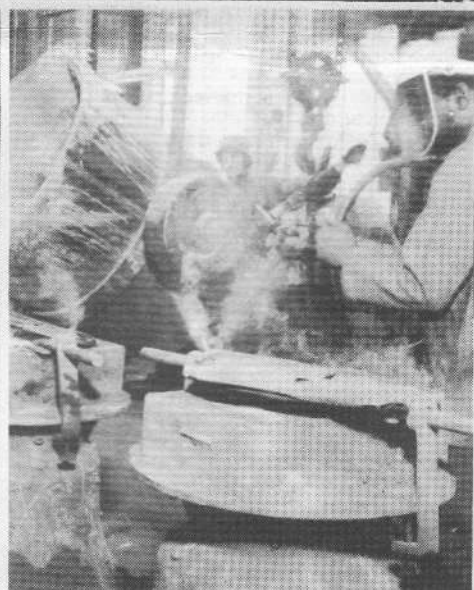
Casting the new bells.