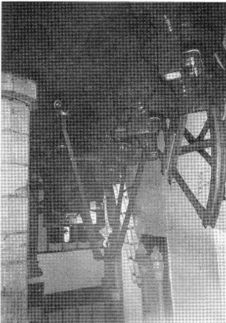
Hurworth bells awaiting hanging.

ALL SAINTS, HURWORTH ON TEES IS HAVING AN OPEN DAY ON SATURDAY 7th FEBRUARY AND WELCOMES VISITING RINGERS