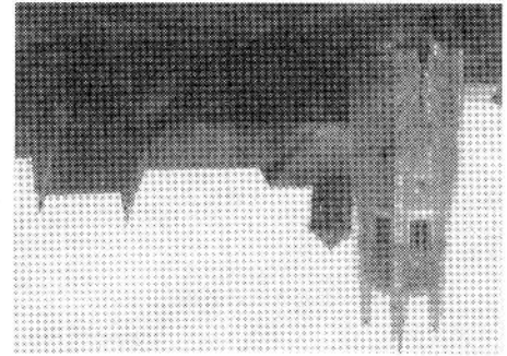
Left, the Victoria tower and St Mary's Church, Chatham (see front page article). Church is 1788; chancel 1889; tower 1897. The 18th century church was rebuilt in 1903. Below, details of the bells.