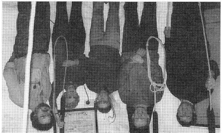
Hurworth ringers at rededication service.

A rededication service was held on Sunday 4th January at 10.30am when we hope ringing will commence at 9.30. Visiting ringers are most welcome, but we realise it might be inconvenient to leave your own towers unring on a Sunday. With this in mind we are planning an Open Ringing Day on Saturday 7th February where visiting ringers will be most welcome. Practices will recommence in the New Year -